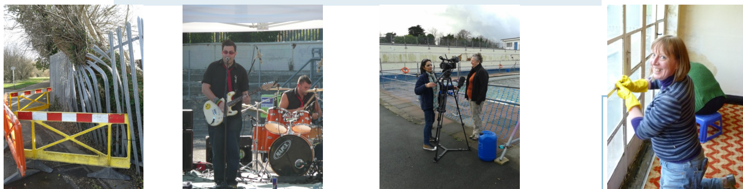
Working together to create a new Hilsea Lido, from left: Removal of fallen trees with the support of Portsmouth City Council; Fundraising at Live@theLido, supported by a variety of local musicians; Spreading the word via media support; Preparing for painting.

The Trust will be focussing on the practicalities of the management of Hilsea Lido and gaining feedback on what people want from this facility and how the Trust can best deliver its objectives. The Lido buildings continue to be renovated thanks to our volunteers, they have recently been working to remove old Georgian wired glazing from the original Crittall windows and replace with polycarbonate panes, painting of the outside of the building and make the site look presentable. The paint has been donated by a local company and the Trust will continue to improve the buildings as best it can. The lack of revenue support, which is provided to other organisations within the city, certainly limits the speed of these improvements and creates additional challenges for the Trust. In addition the lack of working capital to pay for electricity, water, sewage, accountancy, chemicals, training, etc. hinders the purchase of building materials and expertise. Managing people's expectations under these difficult circumstances adds to the Trust's challenges.