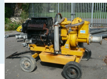
Working together to create a new Hilsea Lido, from left: Cleaning the pool with the support of Cosham Fire Service; Cleaning out the plant room with the support of Army Cadets; Repairing the scum channel; Pumping out pool supported by Selwood.

Eventually Hilsea Lido, which had been designed as a premier venue hosting gala events, will be fully restored complete with high board diving facilities to provide families and young adults with a social and educational hub. The site will provide employment for around 30 part-time and two full-time posts. However the time-scale for this process entirely depends on the resources available to the Trust.