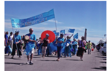
Working together to create a new Hilsea Lido, from left: Completing a pipe survey with the support of Bam Nuttall; Creating a site surround freize with local schoolchildren, supported by Covers; Ceaning & organising the working areas of the Blue Lagoon; Taking part in events to keep people informed.

The considerable progress the Trust has made since 2010 is due to the support it has gained from grant funders, local businesses, the probation service and most of all determined and committed volunteers. To date the social capital and grant funding invested in Hilsea Lido amounts to a considerable sum and this demonstrates the desire from local people to have their lido re-opened. The Trust has always worked towards providing the next generation with the same opportunities many of them experienced in their youth. HLPPT gains inspiration through the school children of this city who are looking forward to Hilsea Lido being open again. The particular interest of young people is often diving (jumping into the water) as well as swimming. In addition to our own consultations with young people and the widespread attention the sport has gained through the popularity of diving champions such as Tom Daley, we were alerted to this recently when it was widely reported that 200 children went to a diving squad selection event at Southampton. Twenty children were selected for the squad but sadly 180 keen divers were left without the opportunity to access facilities to develop their interest in this high profile and growing sport.